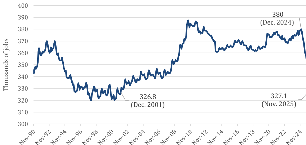
Federal Employment in the Washington Region November 1990 to November 2025

Source: Bureau of Labor Statistics. Not Seasonally Adjusted. GMU CRA.